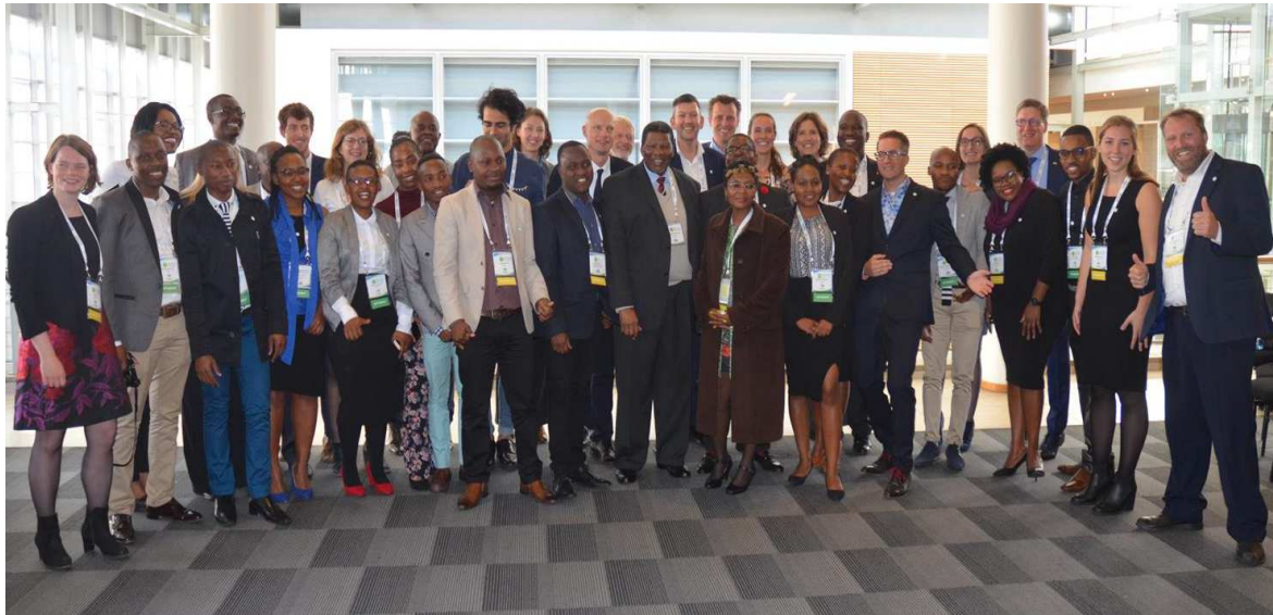
Figure 2 Minister Gugile Nkwinti of Water and Sanitation of South Africa and Wetskills participants that used climatescan during the Wetskills challenge [Dutch water sector, 2018].