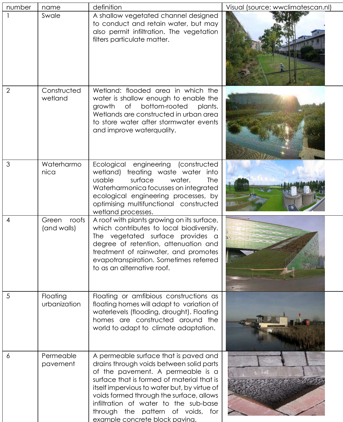
Table 1. Top 10 uploads in categories (Source:) most definitions from https://www.susdrain.org/resources/glossary.html